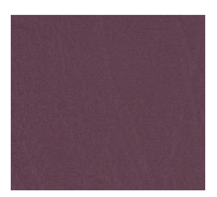
The 7 Collection Wine