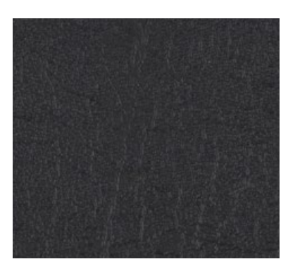
The 7 Collection Black

An extra durable vinyl upholstery fabric with Crib 7 fire retardancy.