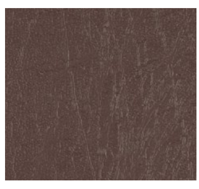
The 7 Collection Chocolate