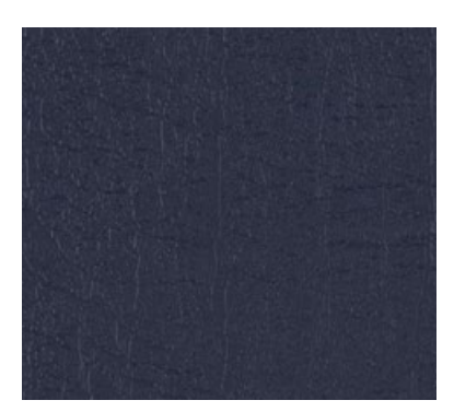
The 7 Collection Ensign