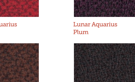
Lunar Aquarius Dark Brown