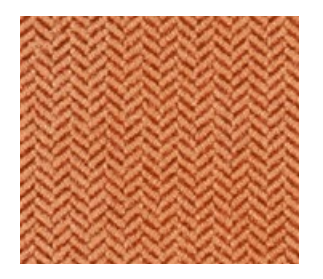
Nova Burnt Orange