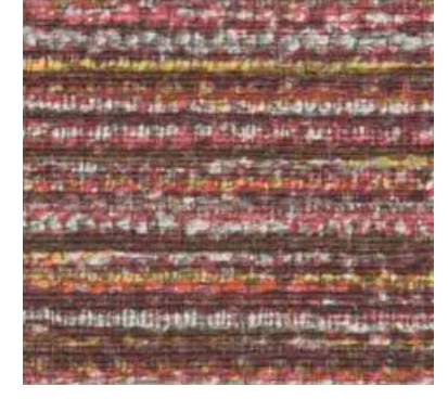
Tierra Eco Cedar