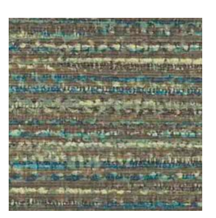
Tierra Eco Moss