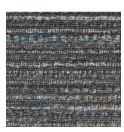
Tierra Eco Flint