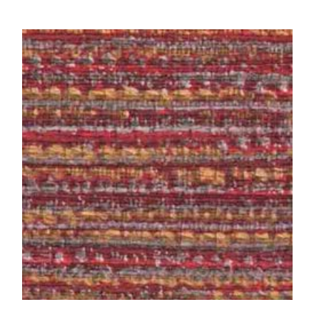
Tierra Eco Cranberry