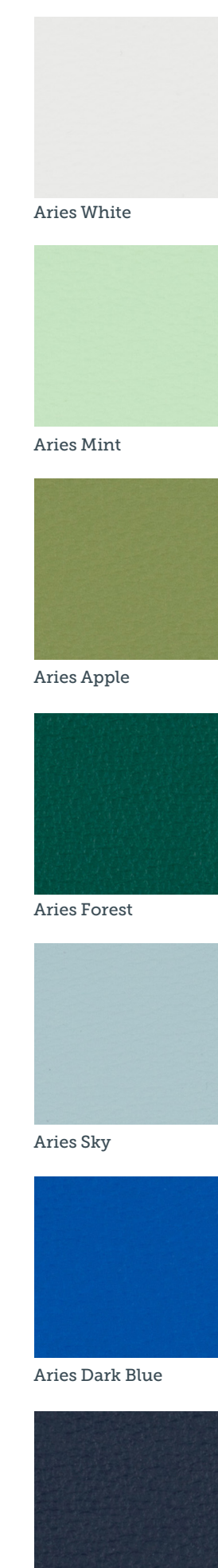
Aries White Aries Mint Aries Apple Aries Forest Aries Sky Aries Dark Blue