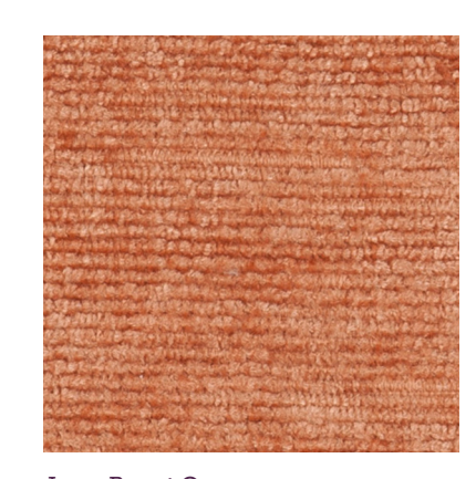
Juno Burnt Orange