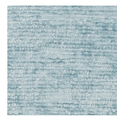
Juno Duck Egg