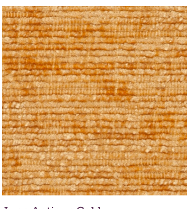
Juno Antique Gold